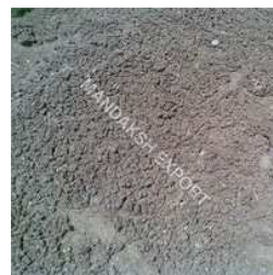
Bentonite Cattle Feed Grade