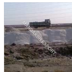
BENTONITE CAT LITTER-GRADE