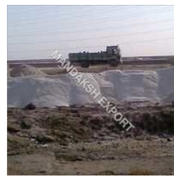
Bentonite Cat Litter- Grade