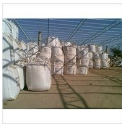
Bentonite Foundry Grade