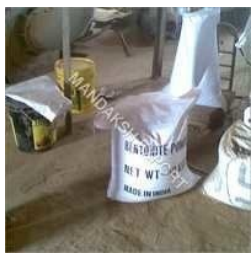
Bentonite Agriculture Grade