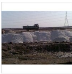
Industrial Salt (NaCl) Earthing Salt