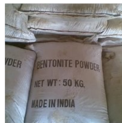
Animal Feed Bentonite