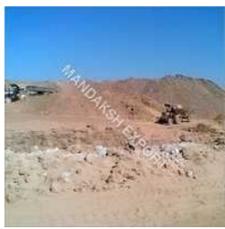
Salt (NaCl) Drilling