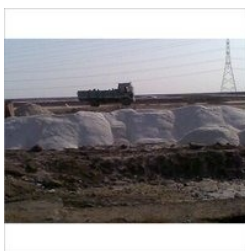
INDUSTRIAL SALT (NaCl) EARTHING SALT