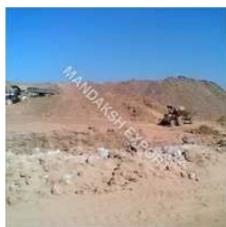
SALT (NaCl) DRILLING

Active Clay Bentonite, Animal Feed Bentonite, Bentonite Cat Litter-Grade, Bentonite API Grade, Bentonite Agriculture Grade, Bentonite Bleaching grade, Bentonite Catalyst, Bentonite Cattle Feed Grade, Bentonite Clay For Hair Growth, Bentonite Clay Industrial Grade, Bentonite Clay Pharmaceutical Grade, Bentonite Coating, Bentonite Earthing Grade, Bentonite Foundry Grade, Bentonite Granules Geo Liner Grade, etc.