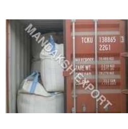
Bentonite Bleaching Grade